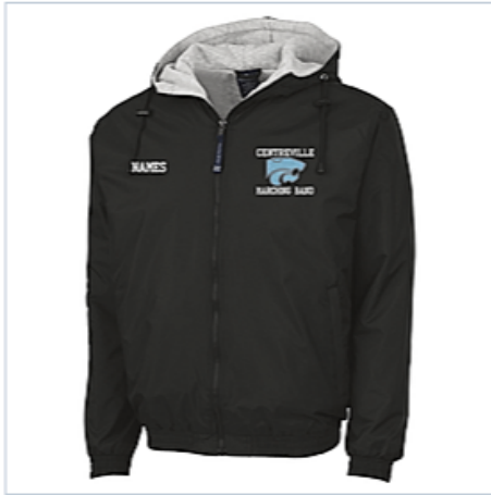
Charles River Adult Performer Jacket

We are selling this jacket as a courtesy. It is not required and is optional for those who want to show their spirit! Please contact Paige Witte at paige.witte@gmail.com if you have any questions about ordering.